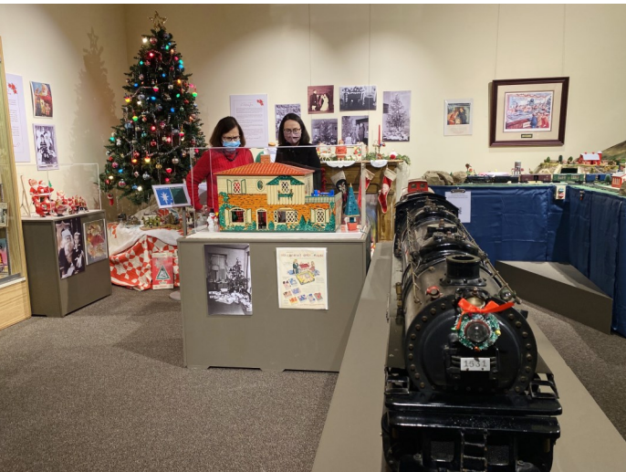
Nov. 21, 2020 – Jan. 16: Christmas Memories: 1930-1959 FREE exhibit in the Kendra Gallery. Video produced.