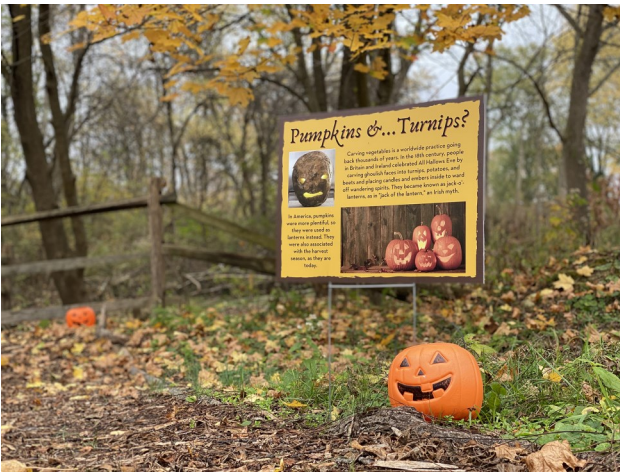
Oct. 23 – Nov. 7: Created a FREE self-guided walking tour around Historic Hanna's Town featuring nine yard signs exploring the history of Halloween traditions and folklore.