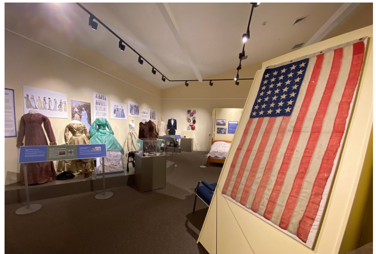
Jan. 1 – Oct. 24: Gems of the Collection exhibit in the Kendra Gallery featuring unique or special items from the WHS collection. This exhibit was FREE.