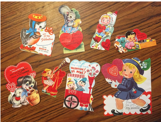
Feb. 8: Valentine's Program included vintage valentines, Storytime, exhibit tour, and giving hand-crafted valentines to Twin Lakes Rehabilitation Center.