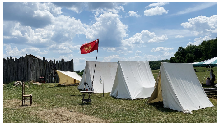
July 4: Independence Day Celebration included militia demonstrations, living history displays, reading of the Declaration of Independence, and tours of Hanna's Tavern.