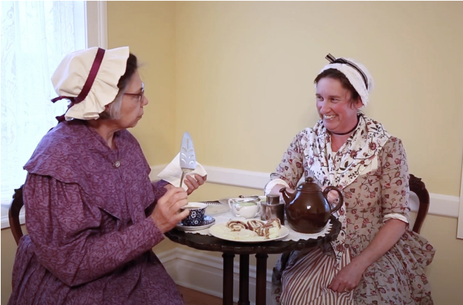
Nov. 7: Debuted a video – produced in-house – featuring the history of Tea Through the Centuries . Here, 18th century meets 19th century customs. Later, these ladies are joined by someone from the 20th century.