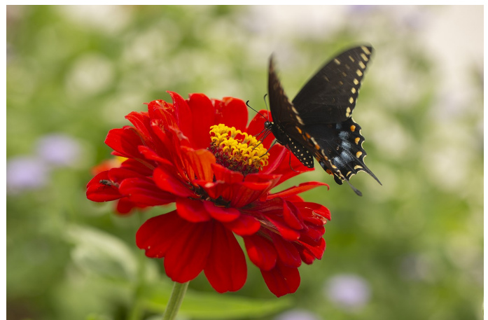
Sept. 27: Photography Workshop in partnership with the Westmoreland Photographers Society focused on flowers and native plants at Historic Hanna's Town.