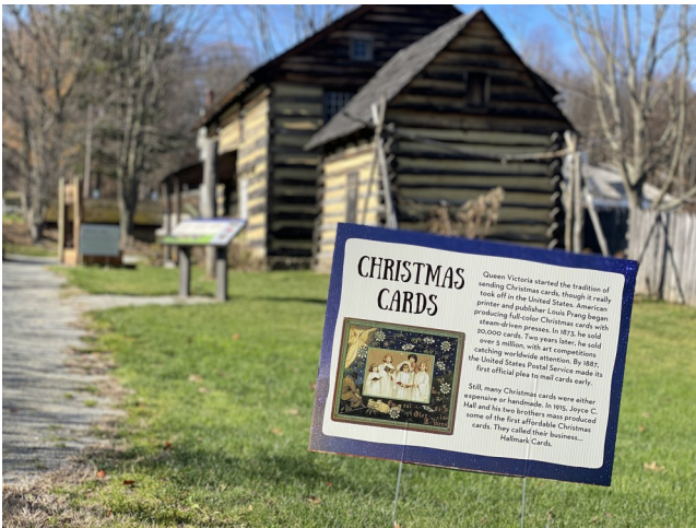
Nov. 27 – Jan. 23: Offered a FREE self-guided walking tour around Hanna's Town featuring 19 yard signs exploring the history of Christmas traditions.