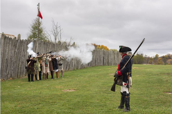
Oct. 24: Fall Family Day included living history displays, militia demonstrations, craft kits, and treat bags.