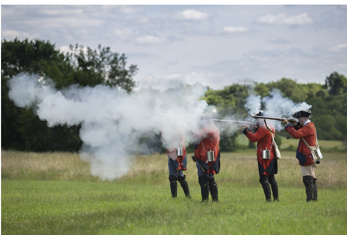
July 13: Posted an educational video about the Burning of Hanna's Town by Seneca and their British allies in 1782, (Posted on the anniversary of the attack.)